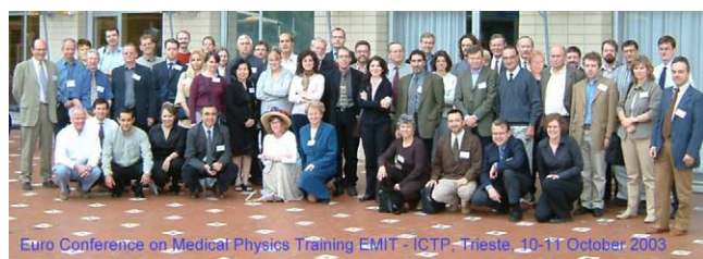
Fig. 3. Delegates to the International Conference on Medical Physics Training with e-Learning Materials at ICTP, Trieste, Italy (10–11 October 2003).

Rating scale: 1, very good; 2, good; 3, acceptable; 4, inadequate.