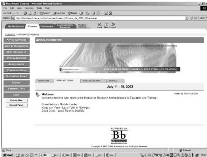
Figure 2: Opening page in the virtual learning environment

providing the scaffolding and support for the ongoing development of the other two components.